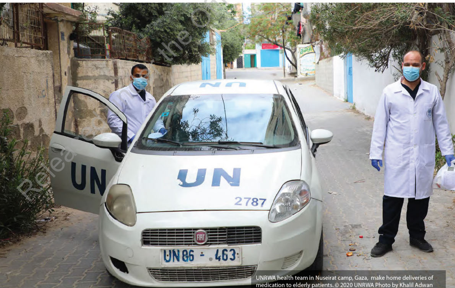
UNRWA health team in Nuseirat camp, Gaza, make home deliveries of medication to elderly patients.