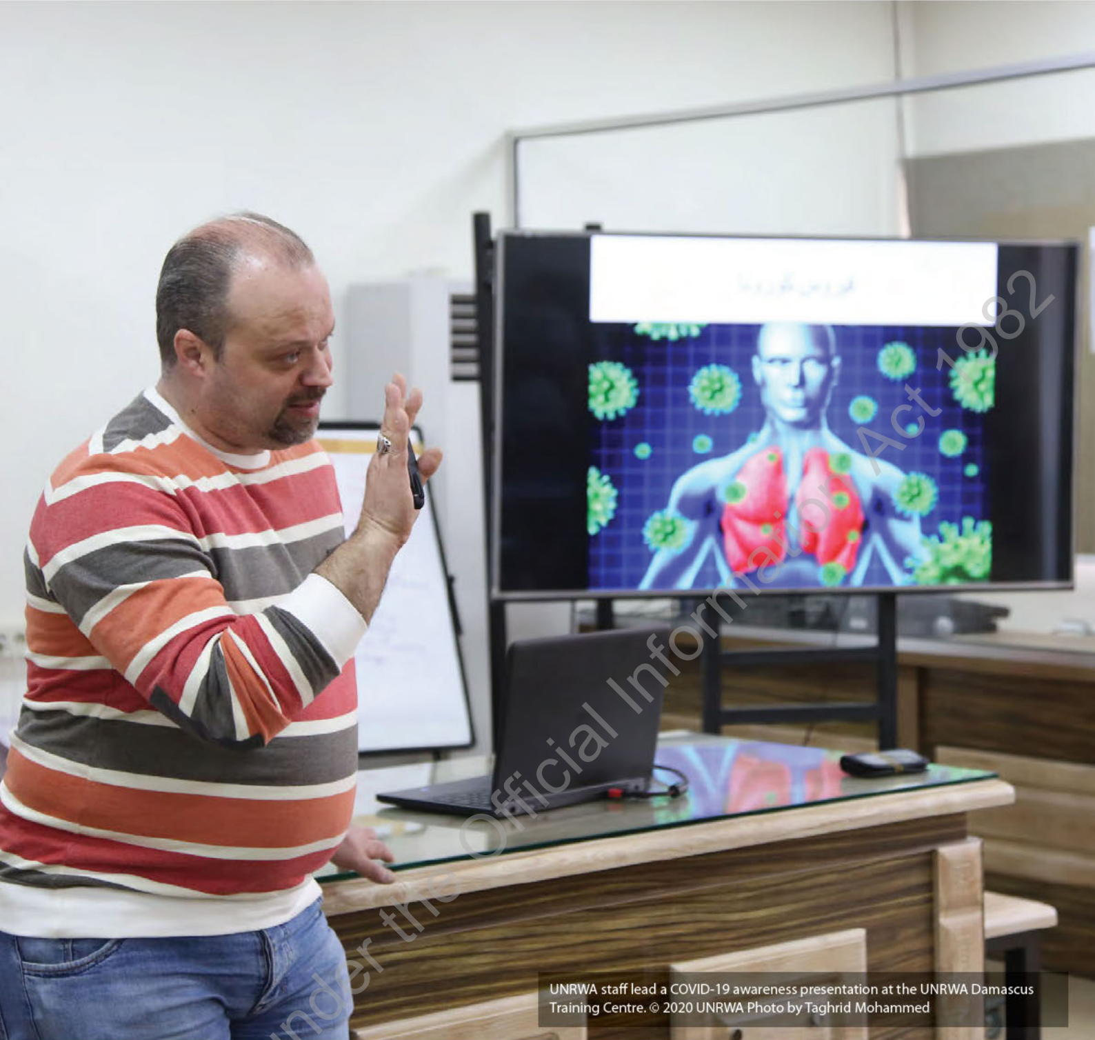
UNRWA staff lead a COVID-19 awareness presentation at the UNRWA Damascus Training Centre.