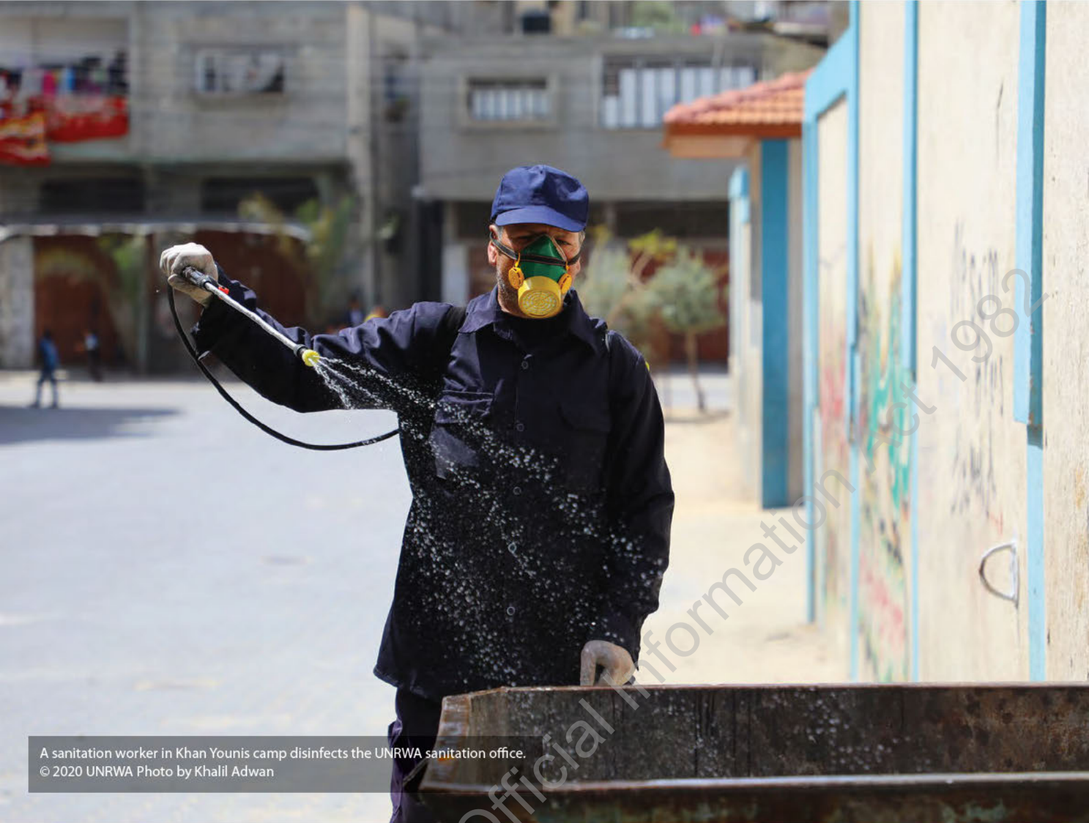
A sanitation worker in Khan Younis camp disinfects the UNRWA sanitation office.