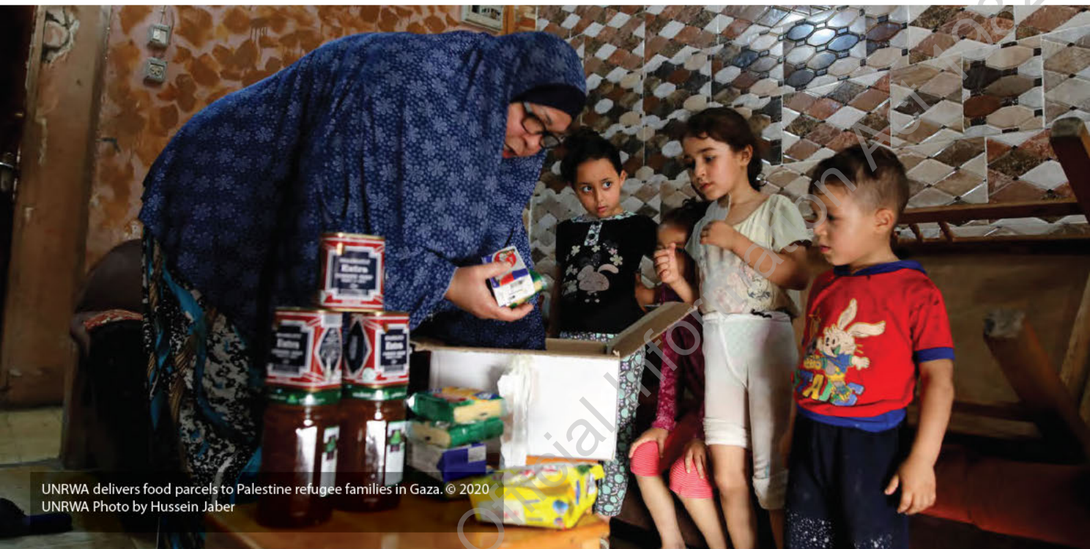
UNRWA delivers food parcels to Palestine refugee families in Gaza.